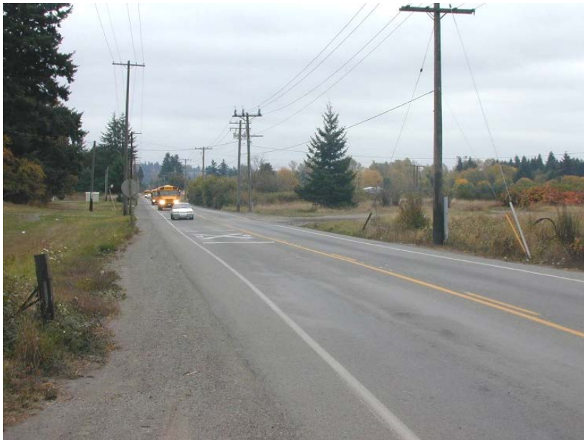
Figure 1 - REYNOLDS AVE - EAST OF INTERSTATE 5

Lewis County and the City of Centralia are collaboratively working together for the improvement of the Reynolds Avenue corridor between Harrison Avenue and Pearl Street (SR 507) and Harrison Avenue corridor between the Harrison Avenue – Reynolds Avenue intersection north to the Harrison Avenue – Goodrich Rd-Kuper Rd intersections.