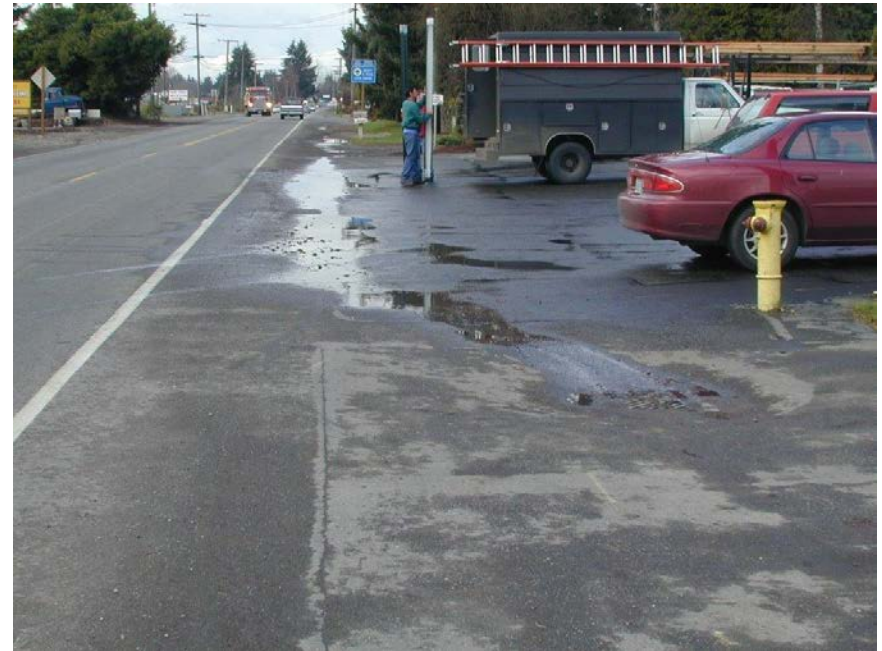
Figure 2 - HARRISON AVE - NORTH OF REYNOLDS-GALVIN RD INTERSECTION

These improvements will consist of widening both roadways to provide a through lane in each direction with a continuous two way left turn lane, curb, gutter, and sidewalk, bicycle lanes, water and sewer utilities, stormwater conveyance and treatment facilities, and street light infrastructures. The project will also include relocating and/or possible undergrounding of power, cable, telephone, and broadband utilities, and consider the installation of bus pullouts.