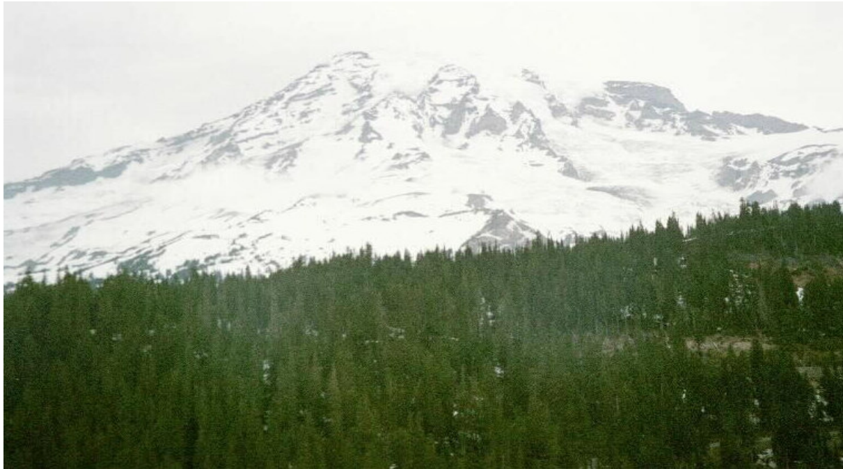
MT. RAINIER VIEW FROM STEVEN'S CANYON PACKWOOD AREA