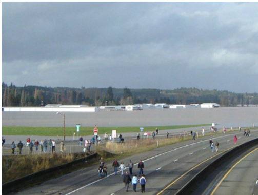
Chehalis Airport from the South Street overpass, Chehalis