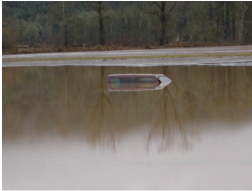
Truck lost underwater in Boistfort Valley, Curtis