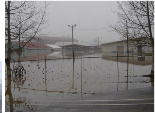
Southwest Washington Fair Grounds, Chehalis