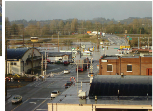
Looking west at Exit 77 on Interstate 5 from the Lewis County Historical Court House