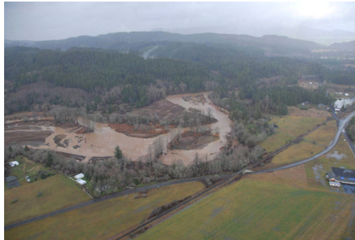
Aerial view of Pe Ell, off Highway 6