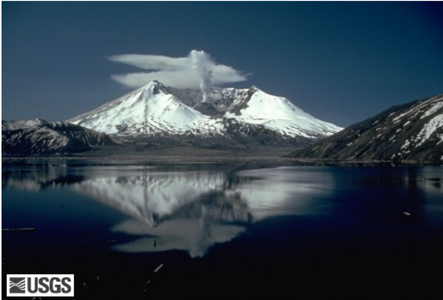
Mount St. Helens