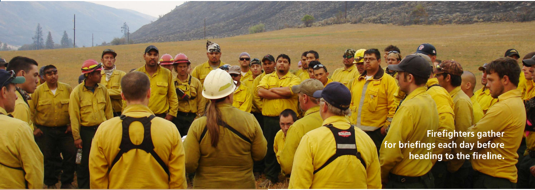
Firefighters gather for briefings each day before heading to the fireline.

Learn more online about DNR Wildfire Assessments