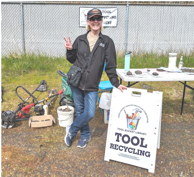
MRC volunteer promoting tool recycling at a Solid Waste Utility free recycling event.

If you are interested in Reducing, Reusing, Repurposing, and Recycling solid waste and have a willingness to use your knowledge, experience, and enthusiasm to make a positive impact in your community, consider becoming a Master Recycler Composter!