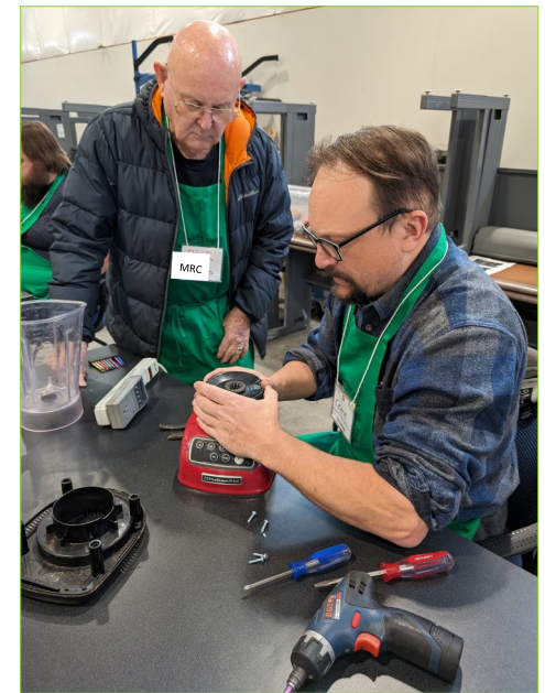
Volunteer "Fixers" saving a blender from the landfill at a Repair & Sustainability Fair.