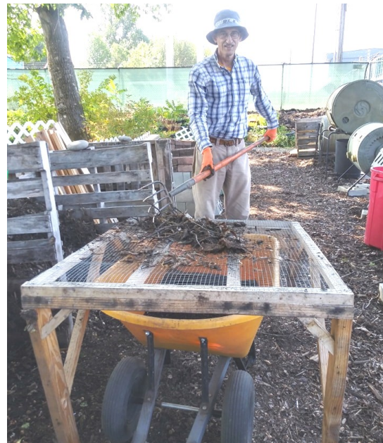
MRC volunteer screening "homemade" compost at Floral Park Sustainability Project.