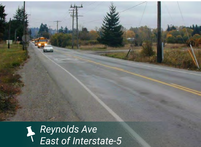
Reynolds Ave East of Interstate-5

The corridor no longer meets the current needs of our growing community because it's missing critical infrastructure like sidewalks and bicycle lanes and must be widened to support our anticipated population growth. The improvements will help people access local businesses and homes safely by walking, biking, or driving, while illuminating the road and beautifying the area.