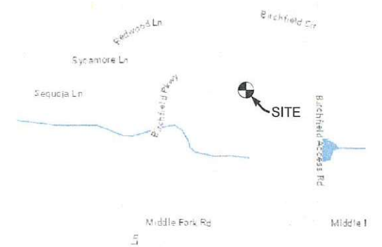
VICINITY MAP NTS